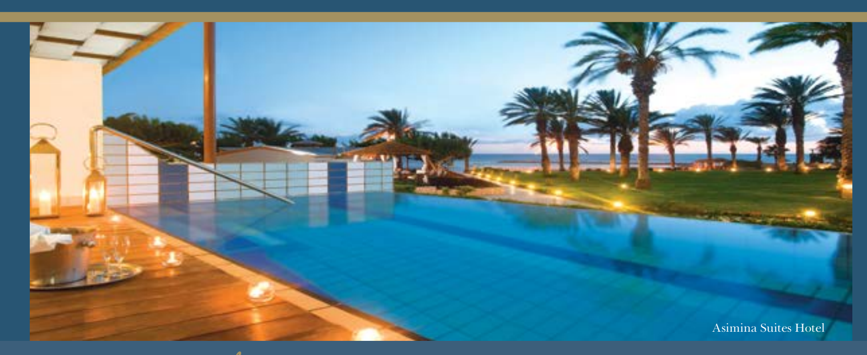
After the champagne toasts and the bouquet toss, it's time for the greatest luxury of all - time alone, together.